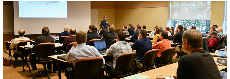
Checking Your Work: Properly Installed HVAC in High-Performance Homes by Dean Gamble of the US EPA on March 4, 2020