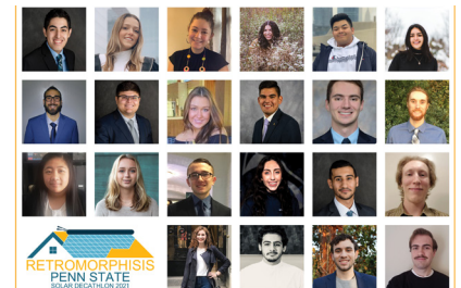
Penn State team for the 2021 DOE Solar Decathlon Design Challenge