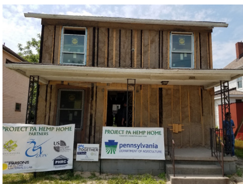
PA Hemp House in New Castle, PA

Despite restrictions for in-person meetings and interactions due to the COVID-19 pandemic, I am pleased to share some exciting progress in our work related to our Residential Construction (RC) program. Most of our activities were carried out through digital communication tools, which proved highly successful in many areas, such as course offerings, participation of students in national competitions (NAHB Student Competition and DOE Solar Decathlon Competition), research meetings with graduate and undergraduate students, research and development (R&D) project meetings, and delivery of outreach activities.