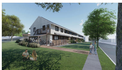
10 Rendering of the 2021 Solar Decathlon Design Challenge design