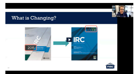
PA UCC Residential Code Update: Part 1 webinar screenshot on Sept. 14, 2021

At the end of the day, it is the PHRC family that makes it all work. That includes the PHRC staff, the Industry Advisory Council, and many other core stakeholders that have supported and engaged with the PHRC for years. Although we are not yet finished with pandemic-related challenges and disruptions, our team is as confident as we have ever been that each day brings us closer to our vision of "a residential construction industry equipped with the knowledge, skills, and technology to build better homes." We hope that you will become part of the PHRC family this year!