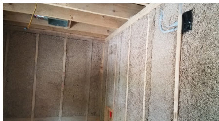
PA Hemp House project after application of hempcrete

The cornerstone of our RC program are several courses related to residential buildings, as well as opportunities for students to enroll in our residential construction minor and housing certificate. We are excited that over forty students have been awarded the residential construction minor and almost thirty students are currently enrolled. In addition to courses such as Residential Building Design and Construction, Construction Management of Residential Building Projects, Building Enclosure Science and Design, Integrative Energy and Environmental Design, and Sustainable Residential Subdivision Design, we are pleased to share that our program—in collaboration with the Department of Architectural Engineering—now offers a new course, Ultra-High-Performance Buildings: Passive House Principles & Design.