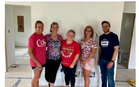
Council members volunteer with Habitat for Humanity of Greater Centre County

Council members also volunteer together in the community. In July, members served at a Habitat for Humanity of Greater Centre County home. The group was able to prime the entire house in their visit.