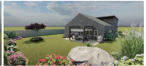
The Bermuda home design exterior renderings