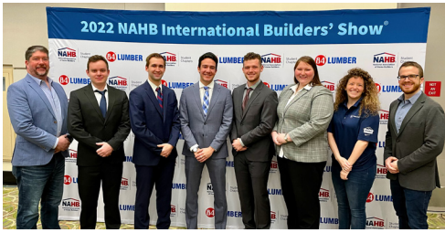
Penn State NAHB Student Competition team with PHRC staff members

The National Association of Home Builders (NAHB) Student Chapter at Penn State placed in the top ten of the four-year programs, production homes category, of the NAHB Student Competition held at the 2022 NAHB International Builders' Show (IBS) in Orlando, Florida. Thirty-four teams from across the United States participated in the annual competition.