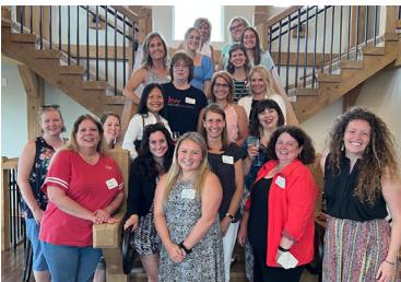
Attendees of Wine Down Wednesday at University Wine Company

Throughout the year, the council organizes events for networking such as Wine Down Wednesday to offer time for meeting others and exchanging ideas over snacks and drinks.