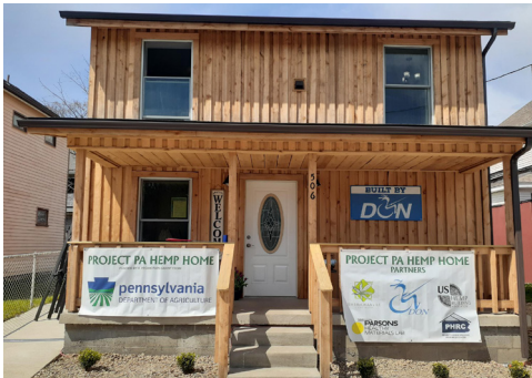
PA Hemp House in New Castle, PA

It is with great pleasure that I can report on the progress we have made in support of the residential construction (RC) program over the past year. The activities include residential-related courses, student participation in national competitions, research projects on innovative materials and systems for residential construction, and the Residential Building Design & Construction Conference (RBDCC).