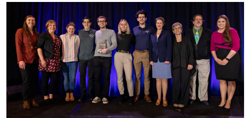
The Penn State team accepting their third place award.