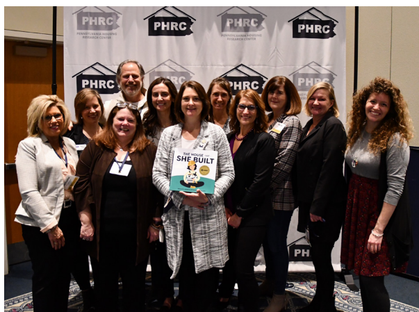
Pennsylvania PWB Council members at the PHRC Housing Conference Celebrate Reception on March 2, 2022