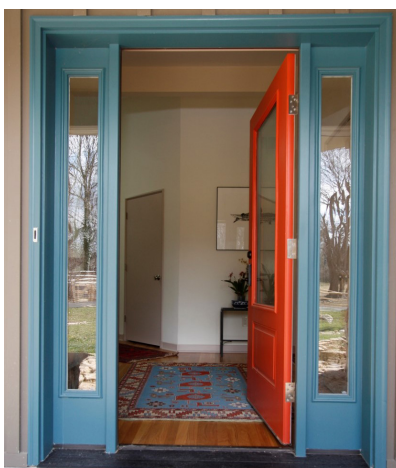
Zero-step entry

There are several approaches to residential energy auditing to achieve various goals such as a homeowner looking to save energy costs, a designer confirming a home is meeting its intended energy performance, or a utility striving for permanent energy usage reductions in its territory. This webinar will explore the various reasons for commissioning a residential energy audit, the associated energy auditing process, and final product for those end goals.