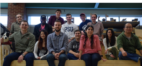
DOE Race to Zero Student Design Competition team for Penn State

The PHRC supported the "Full Circle" student team to compete in the 2017 United States Department of Energy (DOE) Race to Zero Student Design Competition held on April 22-23, 2017 at the National Renewable Energy Laboratory in Golden, Colorado, which featured thirty-nine teams from thirty-three schools across the United States and Canada. The competition challenges