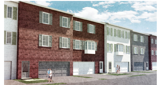
Penn State NAHB RCMC design for site in Decatur, Georgia

The Toll Brothers IBS Travel Grant, the National Housing Endowment IBS Travel Award, and the University Park Allocation Committee generously provided the 2016-2017 team travel support.