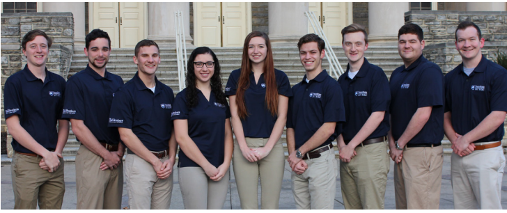
Penn State NAHB Student Competition team

In January 2017, the Penn State National Association of Home Builders (NAHB) student chapter won fourth place in the Four-Year Program category of the NAHB Student Competition held at the 2017 NAHB International Builders' Show (IBS) in Orlando, Florida.