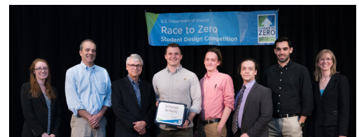
Penn State team attending the 2017 DOE Race to Zero Competition

Optimizing aesthetics, affordability, and energy performance, the resulting design was a set of three net zero energy townhomes to meet the mixed income workforce housing needs while visually appearing as equal units per ordinance requirements. This set included a 1,150 sqft, 2 bedrooms, 1.5 bathroom model for occupants earning 80 percent of the MFI, a 1,400 sqft, 3 bedrooms, 2 bathrooms model for 100 percent of the MFI occupants, and a 1,600 sqft, 3 bedrooms, 2.5 bathrooms model for 110 percent of the MFI occupants. Each townhome had a solar photovoltaic