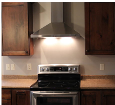
Kitchen range hood

As homes become more energy efficient, it is important that the mechanical systems are able to respond to the needs of the building. This webinar will discuss some of the principles of hot water generation including selection of equipment, analyzation of current code requirements for hot water systems, and examination of best practices for creating an efficient overall domestic hot water system.