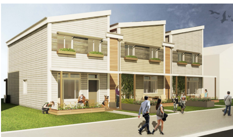
Full Circle townhomes design

The PHRC supported the "Full Circle" student team to compete in the 2017 United States Department of Energy (DOE) Race to Zero Student Design Competition held on April 22-23, 2017 at the National Renewable Energy Laboratory in Golden, Colorado, which featured thirty-nine teams from thirty-three schools across the United States and Canada. The competition challenges