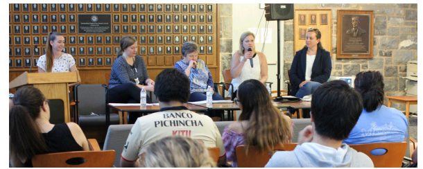
Panelists share their professional and personal experience in the industry

specialist for the PHRC. The chapter hopes to build off the success of this first NAHB Professional Women in Building Week event each September.