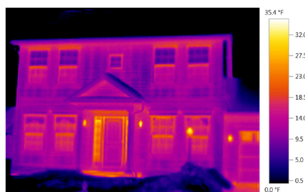
Thermal image from blower door test during energy audit

The design of a radiant floor heating system goes beyond just heat calculations. The structure itself must be examined and correct materials must be used with this type of heat. This webinar will look into material compatibilities when installing radiant floor heat along with simple design methods.