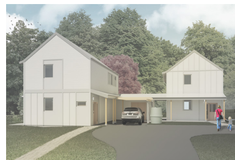
Zero Energy Ready Home duplex in State College, PA

Technology is an ever changing component within a home. Taking that into consideration, this webinar will look at some of that technology and how it can be incorporated into the functionality of the home now and in the future. This will range from standard wireless capabilities to complete home automation.