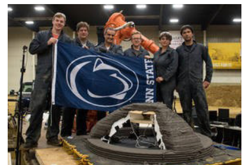
Penn State team for NASA 3D-Printed Habitat Competition

Finally, we are thrilled that our 4 th RBDC Conference with 109 abstracts submitted shows more than 100 percent increase in abstracts submitted to the 3 rd conference. This event will bring researchers from thirteen different countries to share their R&D efforts related to housing and residential construction. Besides the opportunity for exchange of ideas, this expertise forum will assist builders, designers, material manufacturers, and code officials to become more familiar with the latest developments and advancements in this field. The goal and hope is that this conference series will impact the home building industry for improved health, safety, serviceability, sustainability, energy efficiency, resiliency, and cost-effectiveness.