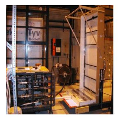
Test Set-up: Airflow Chamber