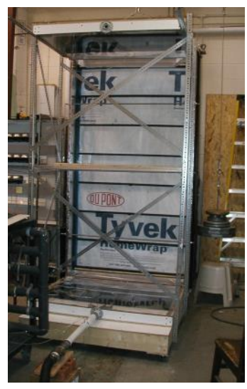
Ventilation Drying Test

The facility has been and still is being used for a comprehensive program of research on the performance of above-grade enclosure wall systems. Of particular interest are sheathing membranes (housewraps, building papers), cladding (brick veneer, metal, vinyl, etc.) and the potential for ventilation drying. Research projects have been funded by ASHRAE, the NSF, private industry and state and PHRC funds. At present, testing is being funded by