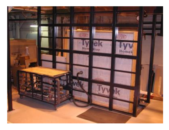
All Purpose ( \Delta_t , \Delta_p , rain) Test Rack