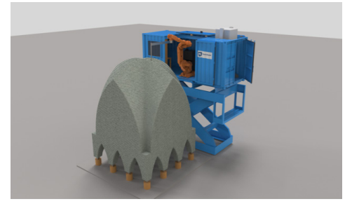
Design concept for 3D-printed concrete home in Alaska

the house to the underlying ground by building the house on elevated piles to avoid melting, which leads to excessive settlement and damage to the home.