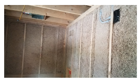
PA Hemp House project after application of hempcrete

The cornerstone of our RC program are several courses related to residential buildings, as well as opportunities for students to enroll in our residential construction minor and housing certificate. We are excited that over forty students have been awarded the residential construction minor and almost thirty students are currently enrolled. In addition to courses such as Residential Building Design and Construction, Construction Management of Residential Building Projects, Building Enclosure Science and Design, Integrative Energy and Environmental Design, and Sustainable Residential Subdivision Design, we are pleased to share that our program—in collaboration with the Department of Architectural Engineering—now offers a new course, Ultra-High-Performance Buildings: Passive House Principles & Design.