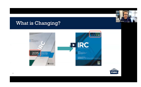
PA UCC Residential Code Update: Part 1 webinar screenshot on Sept. 14, 2021

PHRC staff, the Industry Advisory Council, and many other core stakeholders that have supported and engaged with the PHRC for years. Although we are not yet finished with pandemic-related challenges and disruptions, our team is as confident as we have ever been that each day brings us closer to our vision of "a residential construction industry equipped with the knowledge, skills, and technology to build better homes." We hope that you will become part of the PHRC family this year!