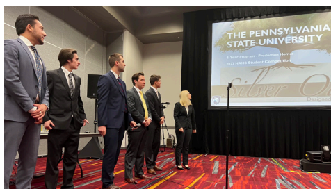
Penn State NAHB Student Competition team presenting at IBS

The National Association of Home Builders (NAHB) Student Chapter at Penn State participated in the production homes category of the NAHB Student Competition held at the 2023 NAHB International Builders' Show (IBS) in Las Vegas. There were twenty-four universities from across the United States who participated in this annual competition.