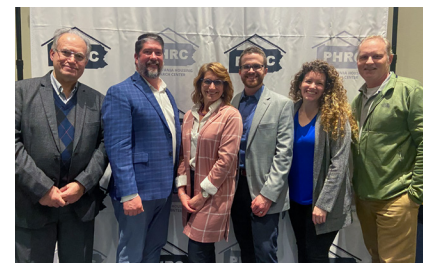
PHRC staff members at the 2023 PHRC Housing Conference on March 1, 2023

Now that the PHRC team is back at full capacity, we are eager to tackle the current challenges facing our industry. We hope that you will join us for our online training opportunities, the 2024 PHRC Housing Conference, and more upcoming activities!