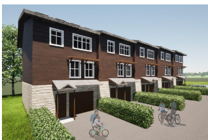
Solarchase townhome exterior rendering

The PHRC supported the Solarchase Team in the US Department of Energy Solar Decathlon Design Challenge. For this year's competition, Penn State partnered with S&A Homes, Inc., a home builder in Centre County, Pennsylvania, which produces approximately 140 residential units annually. S&A and the student team worked together to create a design that implements emerging technologies and building science best practices into high-volume attached housing. The Solarchase design is a five-unit building with each unit having three floors, 1,430 square feet, and a single-car garage. Designed to meet the Zero Energy Ready Homes standard