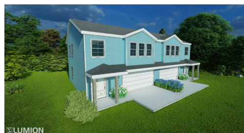
The Scarlett home design exterior rendering

Team travel support was generously provided by the National Housing Endowment IBS Travel Award, the University Park Allocation Committee, and the PHRC.