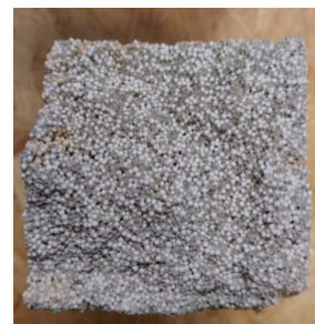
Cross section of a concrete beam cast using mortar and EPS plastic beads as aggregate (EPS Concrete). The mixture is developed for a more insulated concrete.

Housing Conference, which is geared more toward the residential construction industry, so that both conference attendees can network together. More details about the conferences are available on pages 2 and 3.