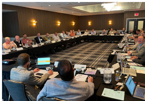
Meeting of the PHRC Industry Advisory Council at Graduate State College on April 21, 2023