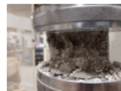
Testing of the EPS Concrete for compressive strength