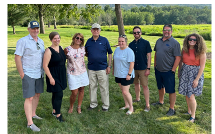
PHRC staff members past and present on July 11, 2023