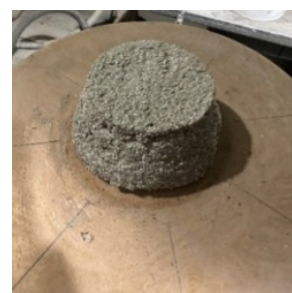
Testing of the EPS Concrete for flowability