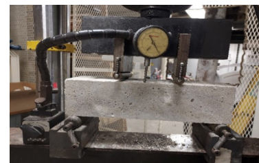
Testing of the EPS Concrete for flexural strength