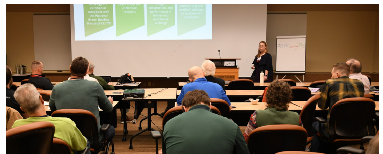
"2020 National Green Building Standard (NGBS) Overview" by Cindy Wasser of Home Innovation Research Labs on March 21, 2023