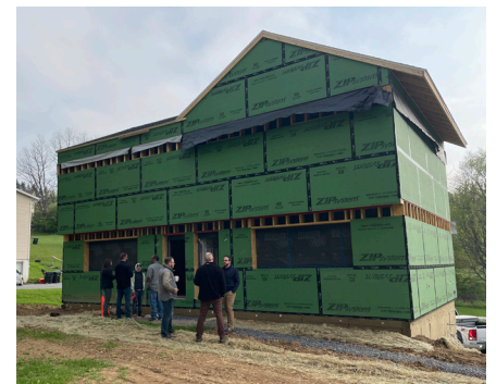
PHRC staff members visit a State College Community Land Trust duplex retrofit as Envinity, Inc. partners with Healthy Energy Pros to apply Aerobarrier on April 27, 2023.